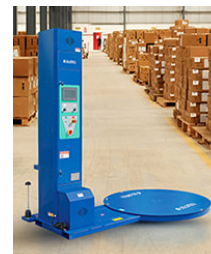
PACKING & SHIPPING