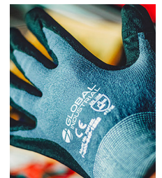
SAFETY & SECURITY