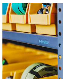
STORAGE & SHELVING